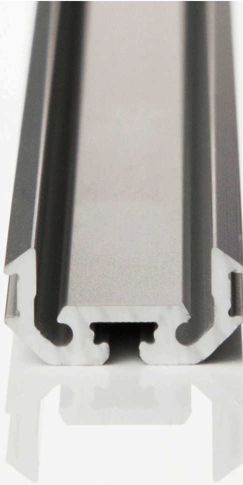
PROFILE | Z200-2